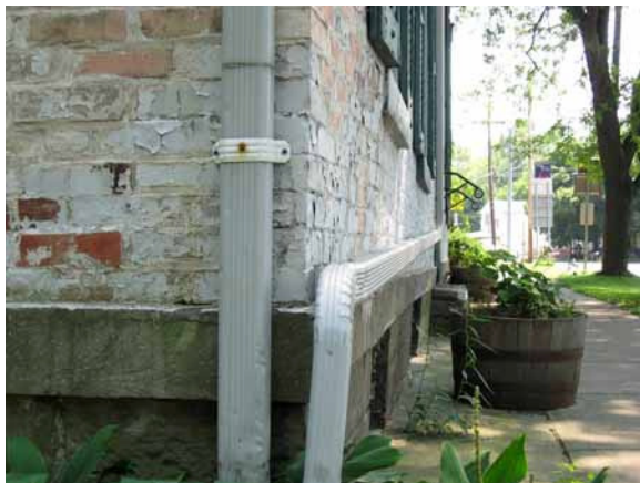
View down front sidewalk.