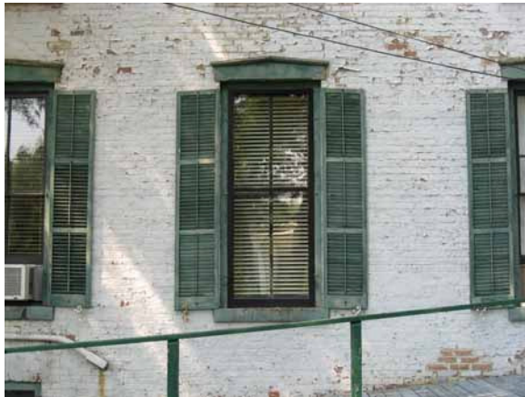
Typical wall conditions.