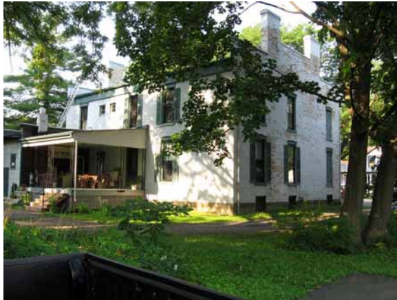
Museum from the Northeast