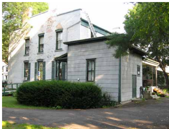
Museum from the Southeast