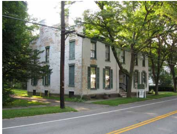
Museum from the Northwest