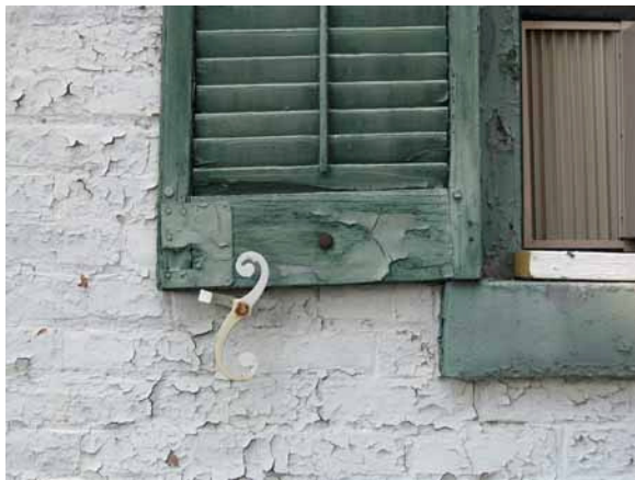
Condition of historic shutters