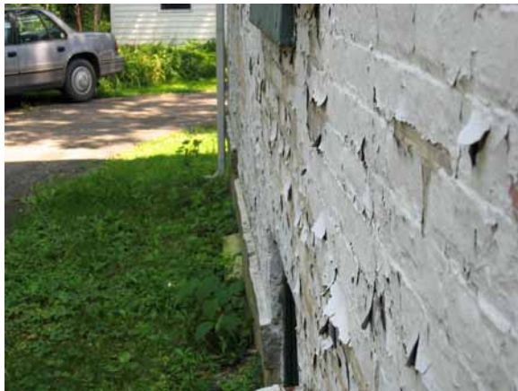
Typical wall condition of Museum.