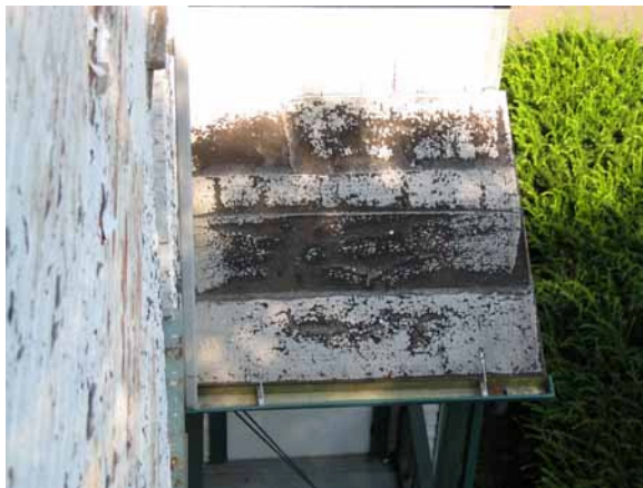
Worn out South porch roofing.