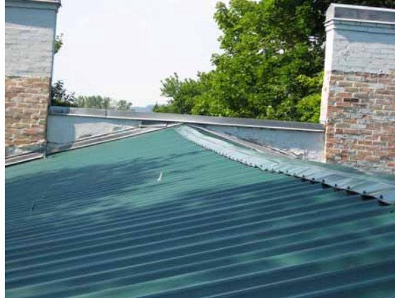
Main roof looking northeast. Note sag in ridge.