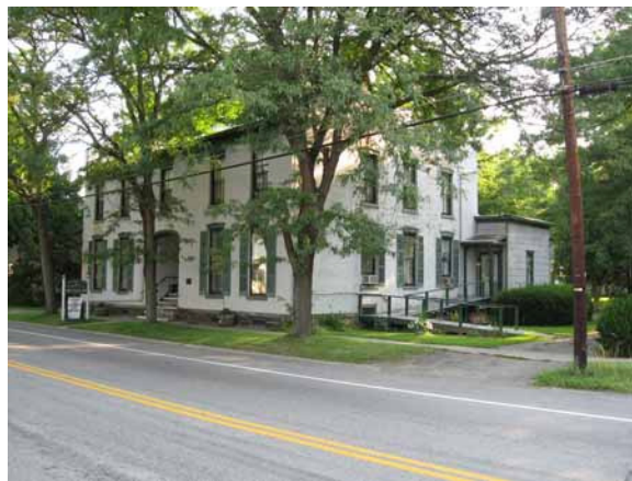
Museum from the Southwest