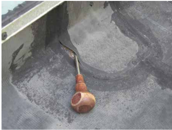
Typical open seam at membrane roofing.