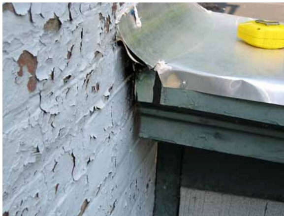
Light-gauge coping cover. Note tear in aluminum at bend and lack of counter flashing.