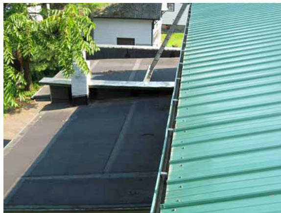
Membrane roofing at porch and southeast addition.